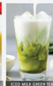
ICED MILK GREEN TEA