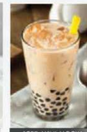
ICED MILK MOCHA