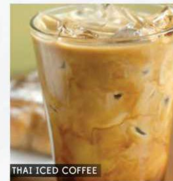
THAI ICED COFFEE