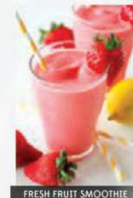
FRESH FRUIT SMOOTHIE