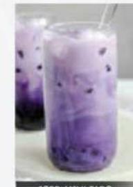
ICED MILK TARO

TAPIOCA OPTIONAL Creamy, sweet and smooth over ice. Matcha Green Tea · Taro · Mocha